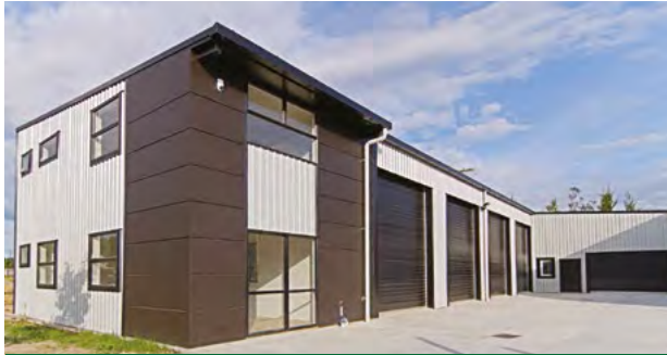
Custom industrial units