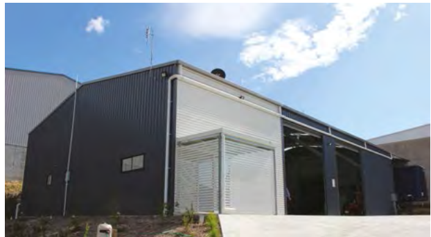
Large workshop with office