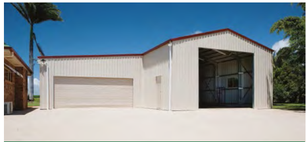
Single garage with enclosed lean-to