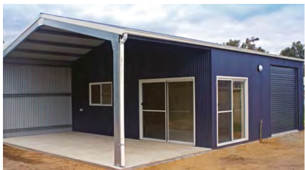
Double garage with office & side garaport