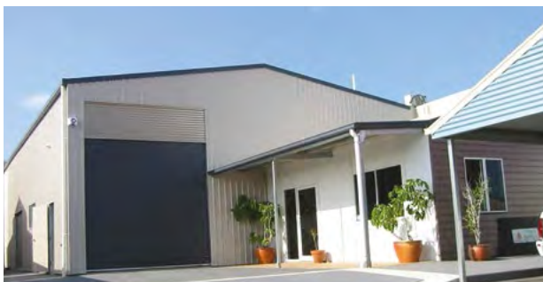
Workshop with office and awning