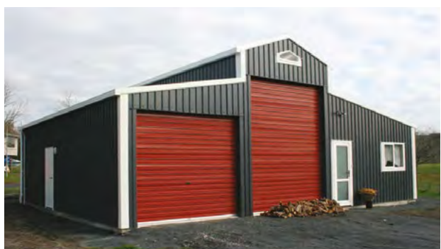
Double stockman barn with office