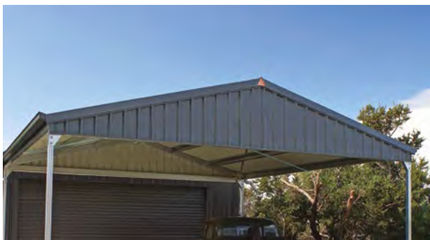
Single gable carport