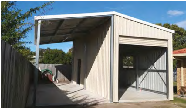
Single skillion garage with garaport