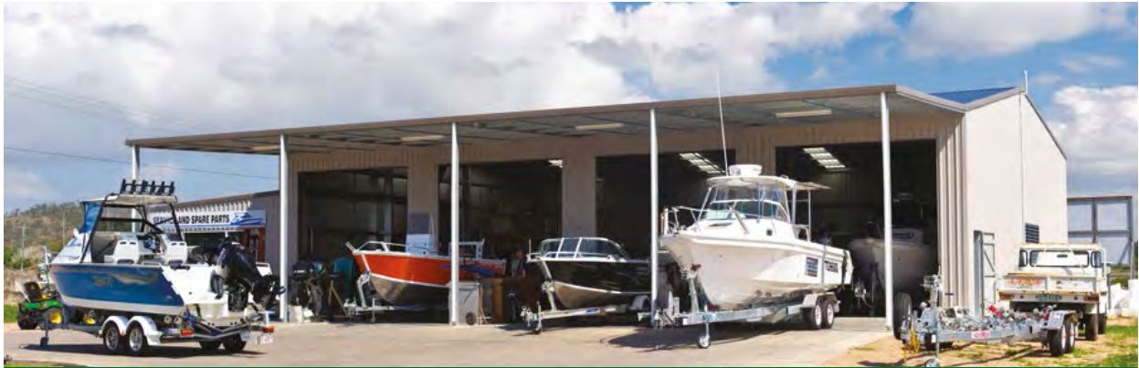
Four bay workshop with awning