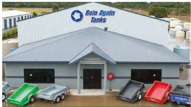
Commercial office and workshop