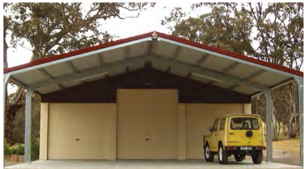
Triple garage with front garaport