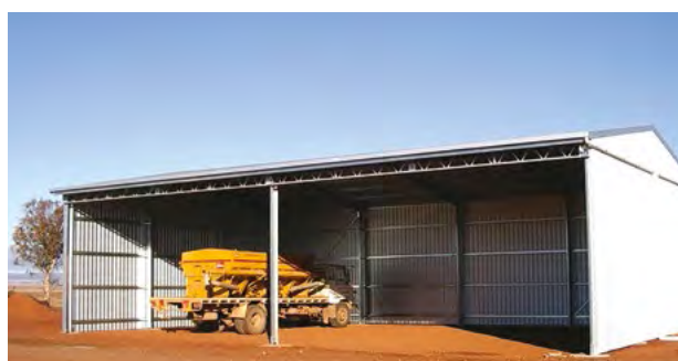
Semi enclosed double bay farm shed