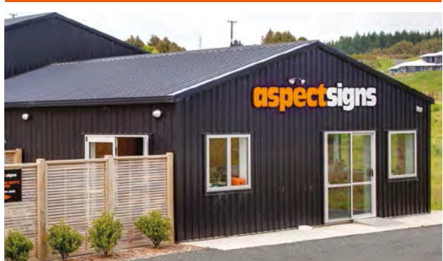
Commercial office with storage