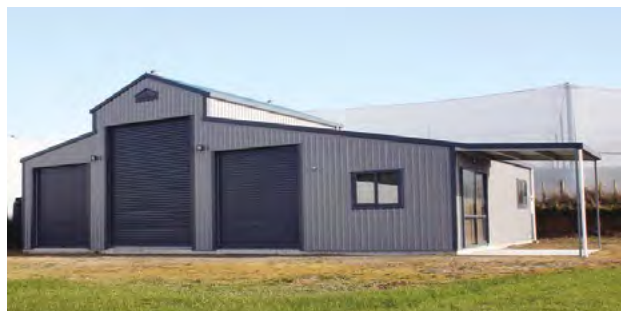
Triple stockman barn with office and awning