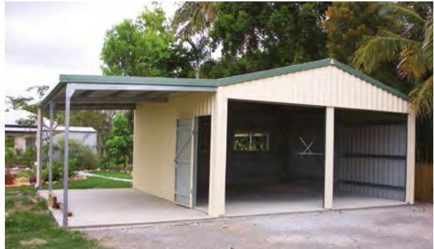
Double garage with side garaport