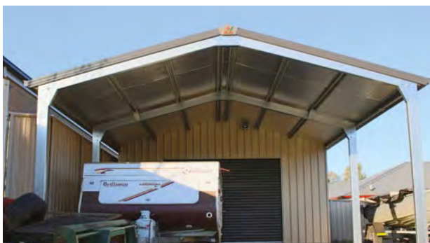
Single garage with front garaport