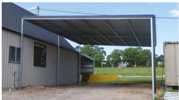
Freestanding single bay flat roof carport