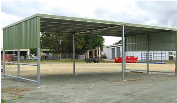
Freestanding double bay flat roof carport