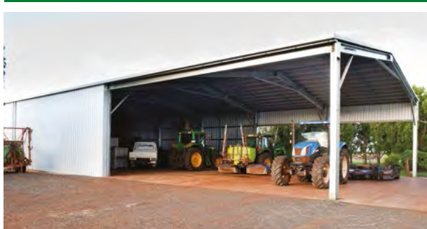
Large farm shed with garaport