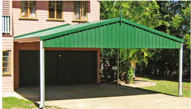
Double gable carport