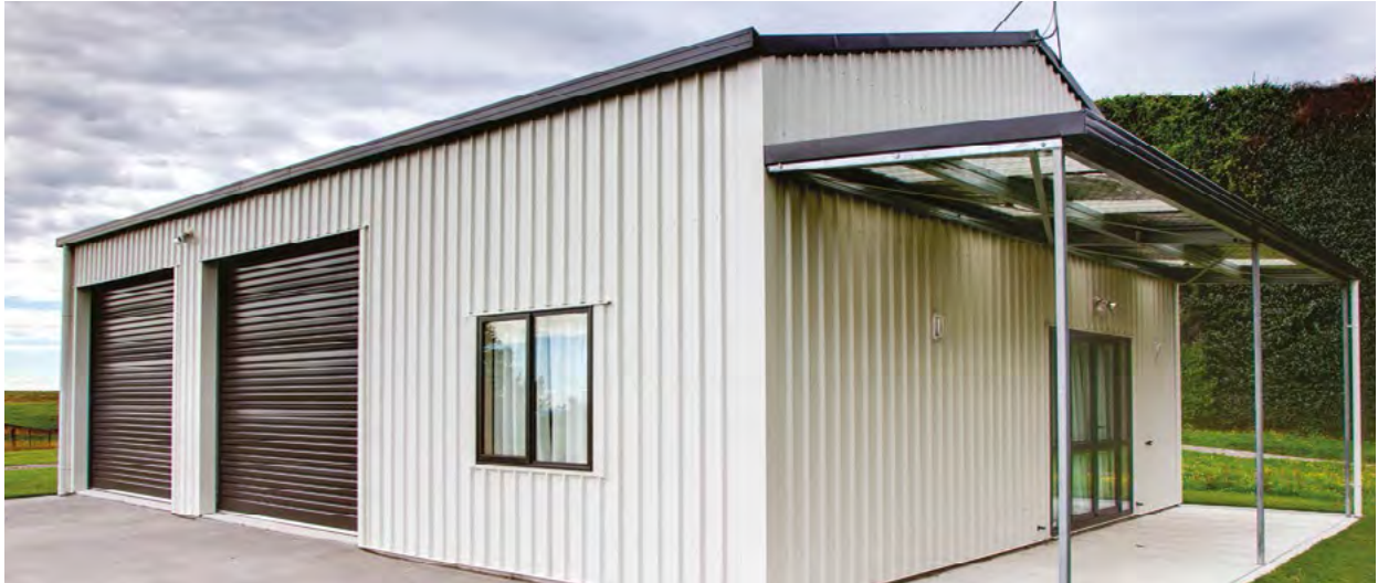
Double garage with office and awning