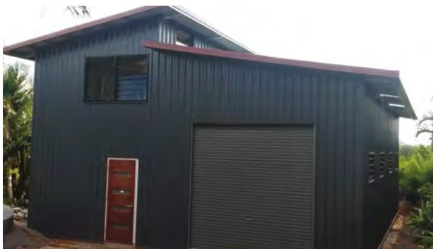
Skillion roof single garage with office and mezzanine