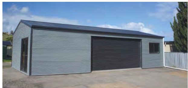
Large roller door garage with side access door