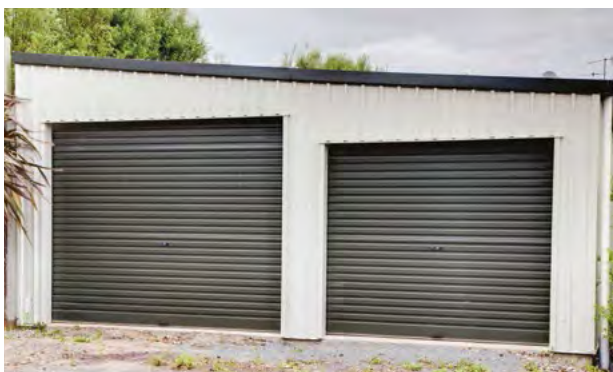
Skillion roof double garage