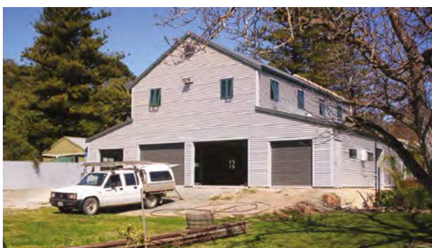
Multi door stockman barn