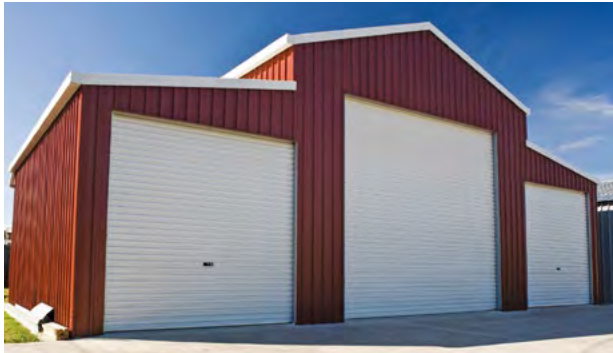
Triple stockman barn