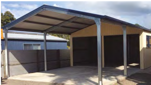
Double garage with front garaport