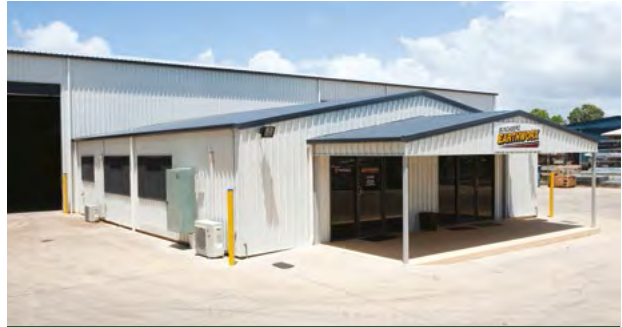
Commercial office with awning and workshop