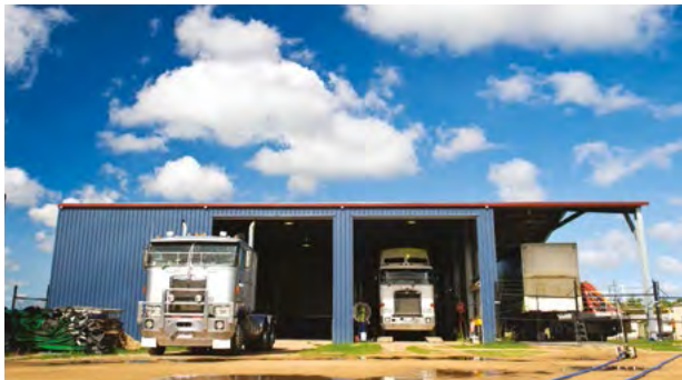
Workshop with open lean-to