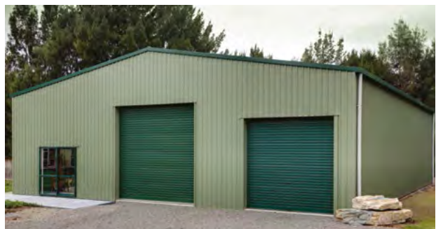
Double garage with glass sliding door