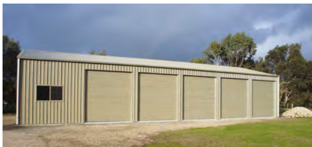
Multiple car garage with office