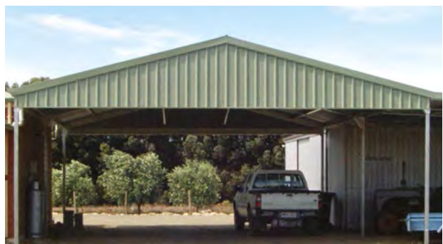
Freestanding triple gable carport