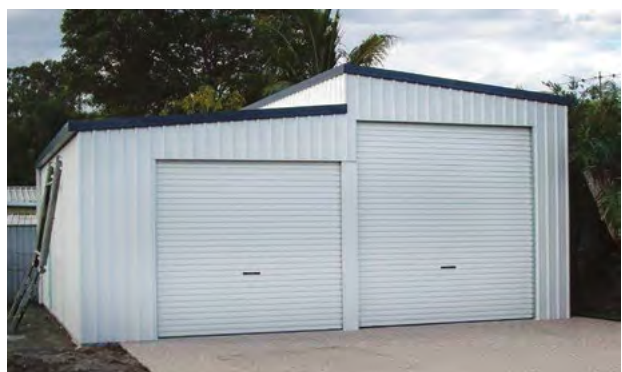
Skillion roof garage with enclosed lean-to