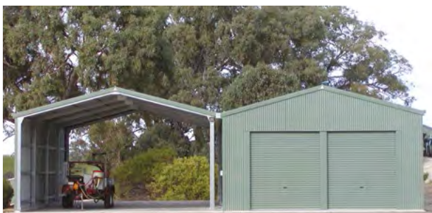
Freestanding semi enclosed carport