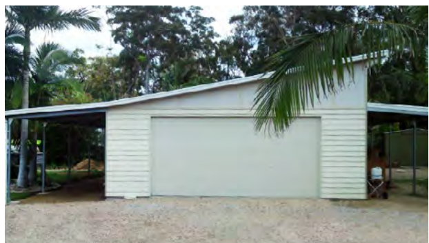
Skillion roof garage with large roller door And lean-tos