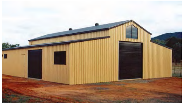
Single stockman barn with side roller door