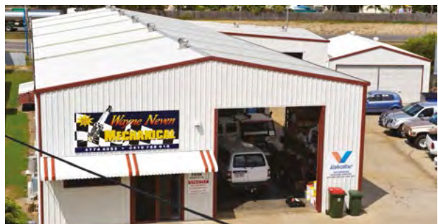
Workshop with mezzanine