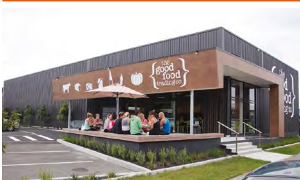
Commercial office and retail space