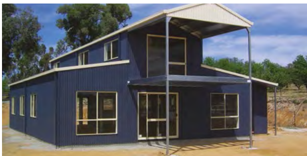
Stockman barn with garaport, mezzanine and balcony