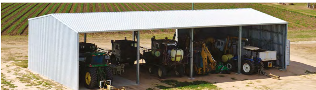
Open four bay shed