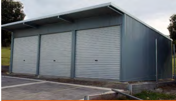
Skillion roof triple garage