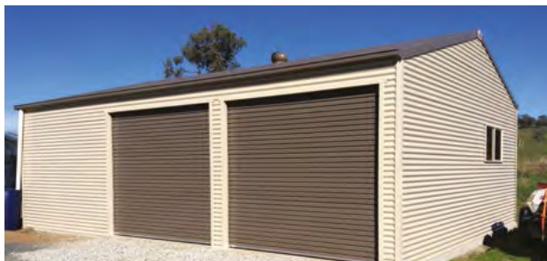
Double garage with workshop