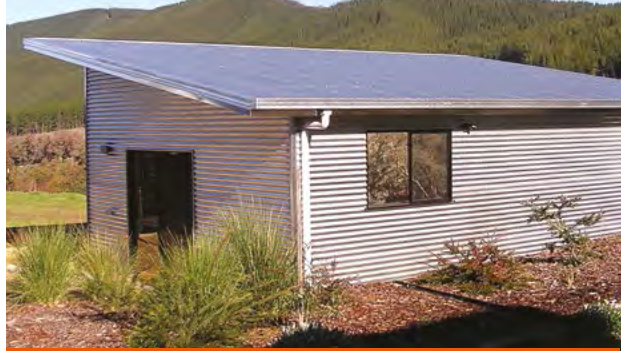
Skillion roof single garage with office